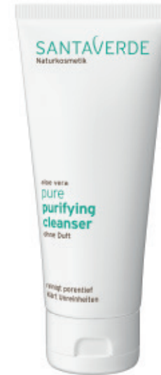
pure purifying cleanser fragrance free • deeply cleanses pores • clarifies impurities