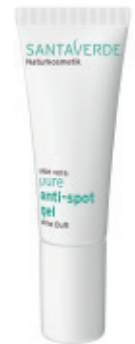
pure anti-spot gel fragrance free • targets impurities • has an antibacterial effect