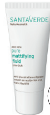
pure mattifying fluid fragrance free • counteracts impurities • gives a matted and clear complexion