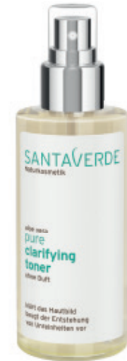
pure clarifying toner fragrance free • clarifies the skin appearance • prevents the formation of impurities