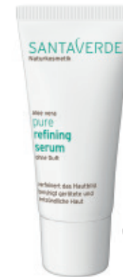
pure refining serum fragrance free • refines the skin • soothes reddened and inflamed skin